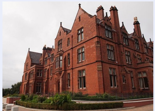
Riddel Hall, Queen's University Belfast

Key Dates: Abstract submission deadline: 29 th January 2016 Early bird closing date: 19 th Feb 2016 Registration closing date: 1 st April 2016